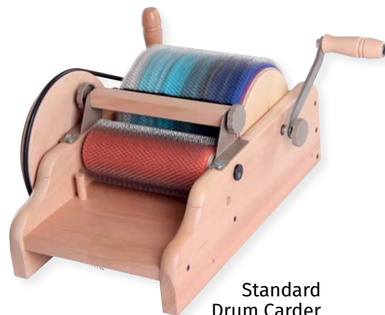
Standard Drum Carder

To view the full range of felting kits, carders, fibres and textile equipment visit www.ashford.co.nz